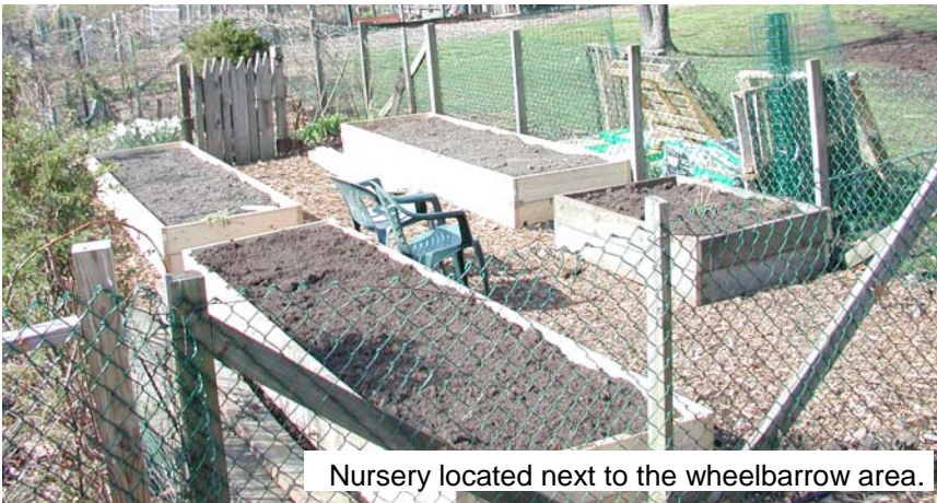
Nursery located next to the wheelbarrow area.

Note that this is a free exchange. Additionally, some common plants aren't welcome. For example, the indestructible Day Lilies that are now found in so many plots and that spread energetically aren't needed. Of course, no one should put invasive species e.g., Purple Loosetrife into the nursery.